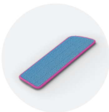
Cleaning mop QSSPRAYMOP

The cleaning kit consists of a mop holder with a refillable water tank and handy lever to easily moisten and mop your floor. Also included: a washable microfibre mop and 1 L of Quick-Step Cleaning product. Now you can clean your floor swiftly and sustainably!