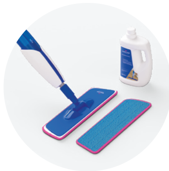
Cleaning kit QSSPRAYKIT

This cleaning product was specifically developed for Quick-Step floors. It cleans the surface thoroughly and safeguards its original appearance, maximising that 'new floor' experience.