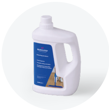
Cleaning product 1 L or 2.5 L QSCLEANING1000 QSCLEANING2500

This cleaning product was specifically developed for Quick-Step floors. It cleans the surface thoroughly and safeguards its original appearance, maximising that 'new floor' experience.