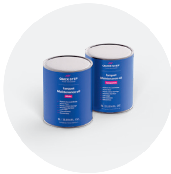
Maintenance oil 1 L QSWMAINTOILN / QSWMAINTOILW

Easily repair light damage and match the original colour of your floor with this kit. For detailed step-by-step instructions, visit quickstep.com .