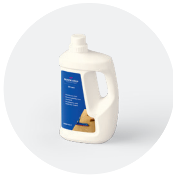
Oil care QSWOILCARE1000

The cleaning kit consists of a mop holder with a refillable water tank and handy lever to easily moisten and mop your floor. Also included: a washable microfiber mop and 1 L of Quick-Step Cleaning product. Now you can clean your floor swiftly and sustainably!