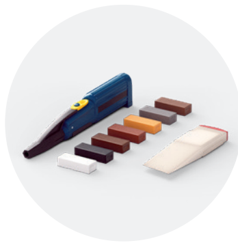
Repair kit QSREPAIR

A sturdy microfiber mop, machine washable up to 60 °C. This mop is compatible with the Quick-Step Cleaning kit.