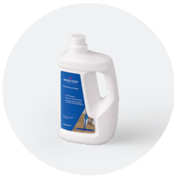
Cleaning product 1 L or 2.5 L QSCLEANING1000 QSCLEANING2500

This cleaning product was specifically developed for Quick-Step floors. It cleans the surface thoroughly and safeguards its original appearance, maximising that 'new floor' experience.