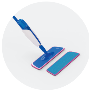
Cleaning kit QSSPRAYKIT

This cleaning product was specifically developed for Quick-Step floors. It cleans the surface thoroughly and safeguards its original appearance, maximising that 'new floor' experience.